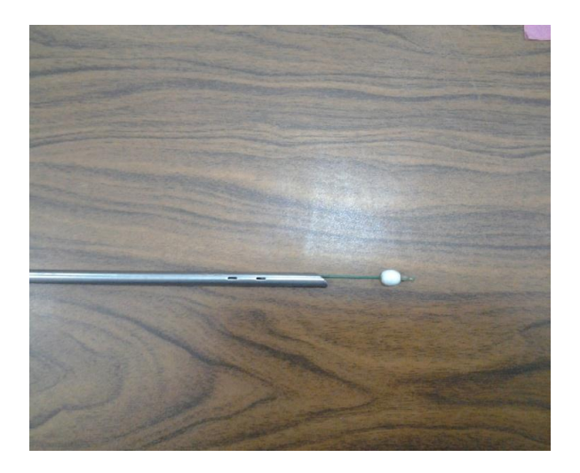
Fig. (2). Fogarty embolectomy catheter FB extraction.