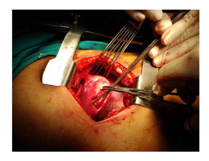
Fig. (6). Thoracotomy and Bronchotomy for foreign body (Pin) extraction, foreign body is grasped and extracted using a mosquito forceps.