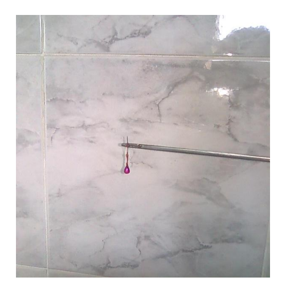
Fig. (3). Magnetic forceps FB extraction.