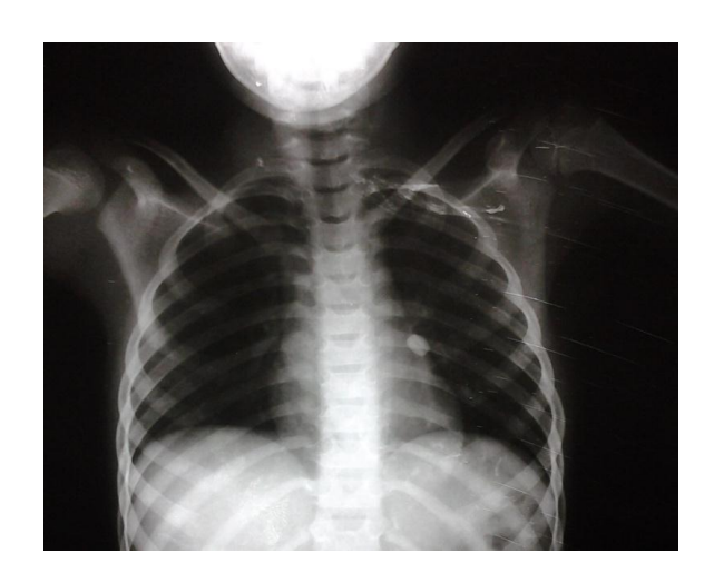
Fig. (1). Left lower lobar bronchus plastic bead (PA view).

For plastic spherical FB, after the failure of extraction using the conventional FB forceps, we used the 7F 80cm Fogarty embolectomy catheter to extract the oval plastic bead. The catheter passed through a central hole in the bead and the balloon was inflated distal to the bead. Finally, the catheter, FB and the endoscope were all removed together as one unit Figs. (1 and 2).